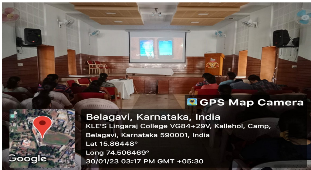
Students and staff watching the documentary